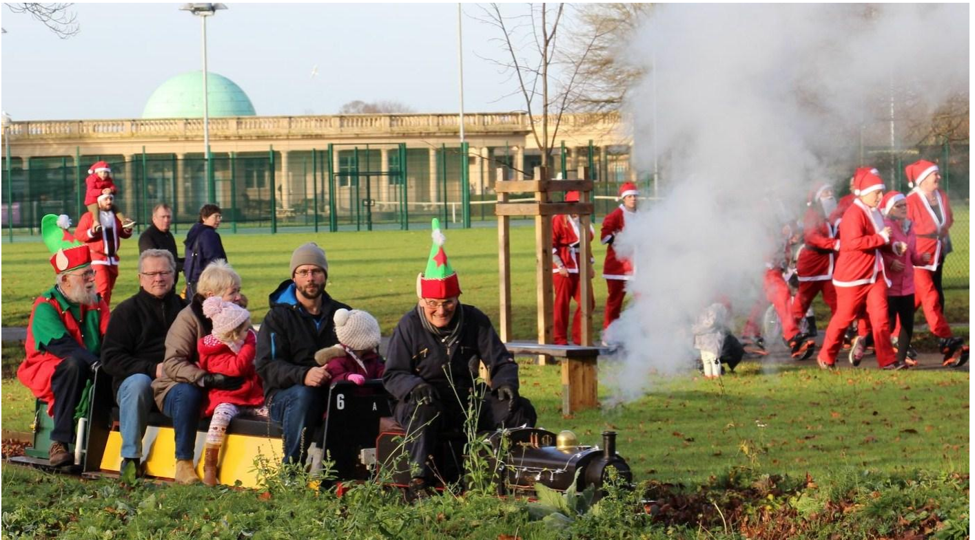
The two elves are ours. Don't know about all the other Santas though!