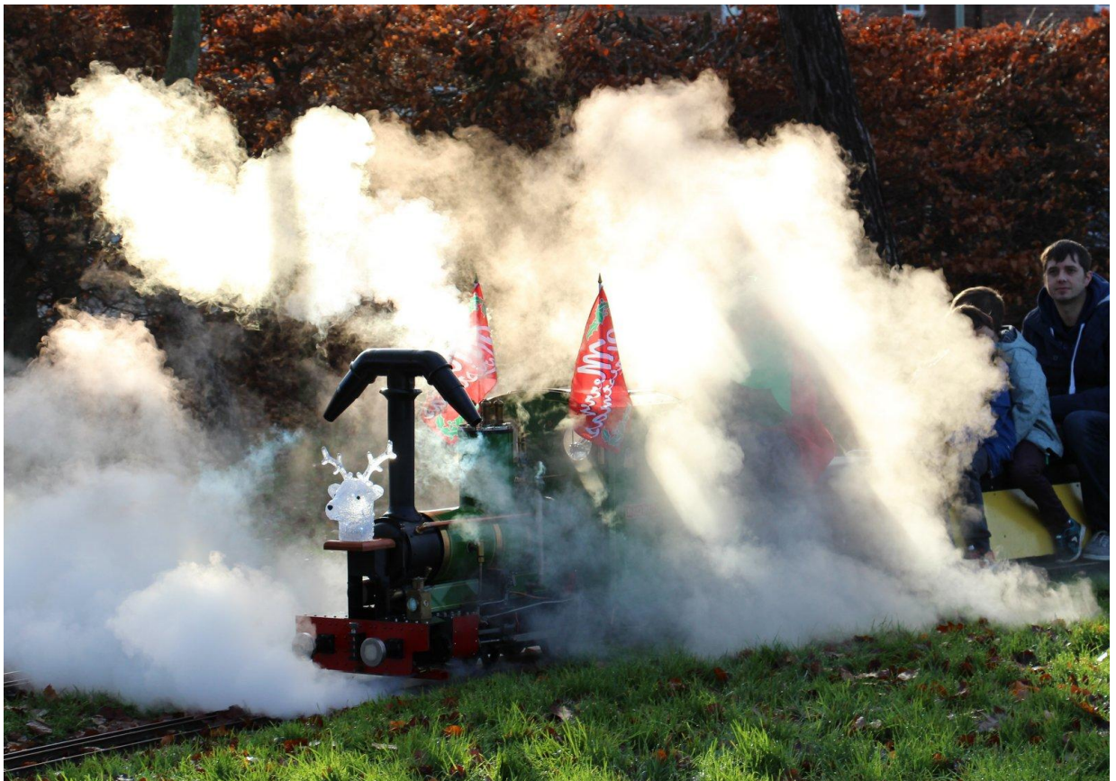
Top – “Are we lost?”