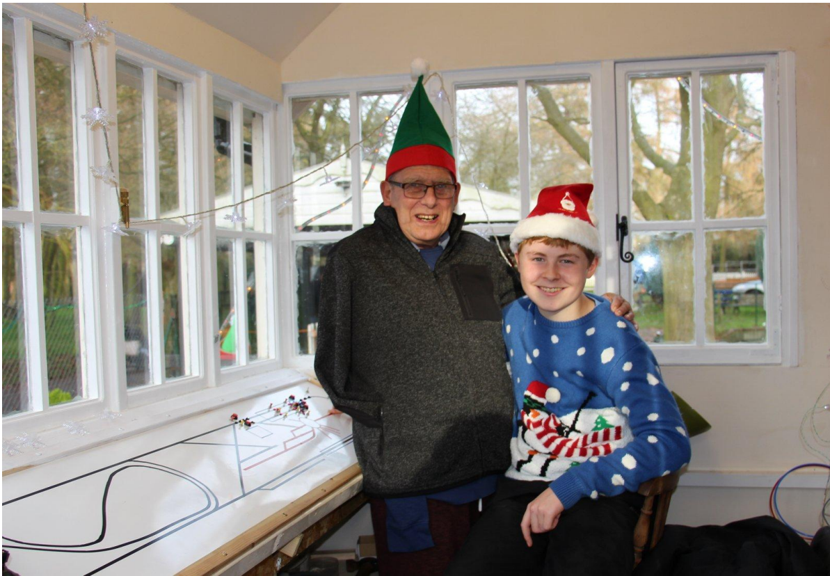
Top – the National Elf Service.