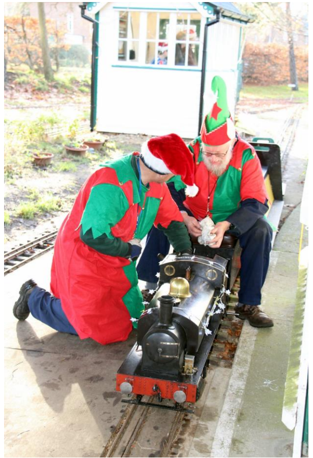
This page – The Elfmeister , an incognito Santa and various elfs.