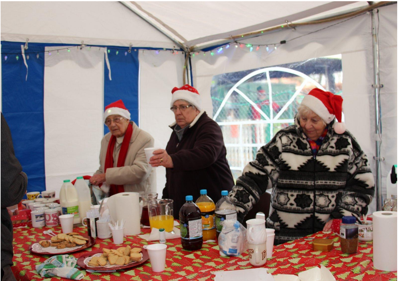
This page – the laydeez